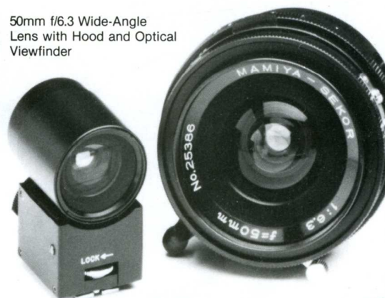
50mm f/6.3 Wide-Angle Lens with Hood and Optical Viewfinder