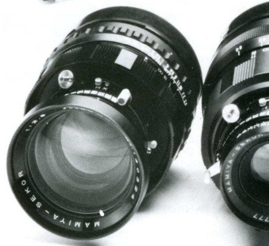
100mm f/2.8 Standard Lens with Hood