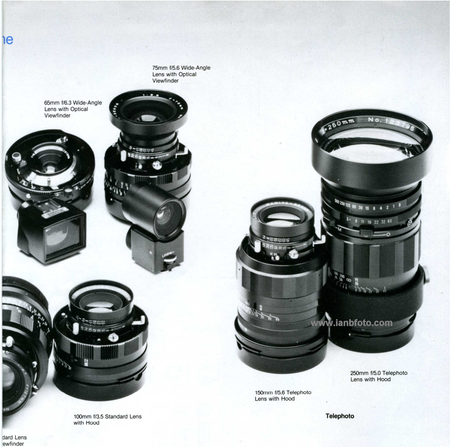
Standard Lens Viewfinder